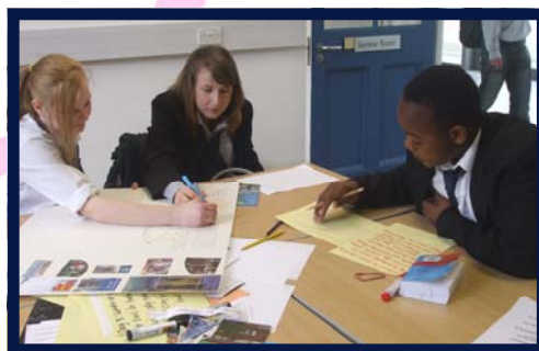
Pictured above: The winning presentation team working hard on their preparation