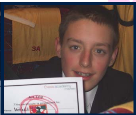
Pictured above: National Portrait Gallery