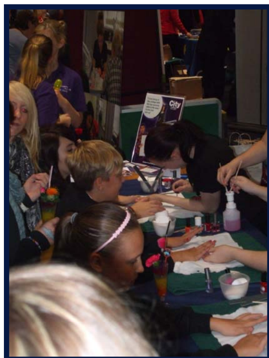
Pictured above: Students visit the hair & beauty area provided by City College, Totton College, Eastleigh College and Above Bar College

Everyone really enjoyed the visit, especially the hair & beauty area. Both male and female students got involved in the 'hands-on' activities and made full use of the exhibitors expertise! Thank you to all involved.