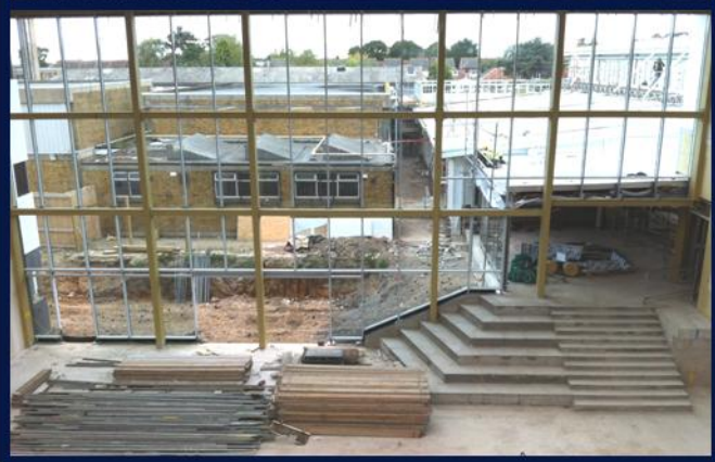
Top picture: Sample classroom near completion Middle and bottom picture: The Agora